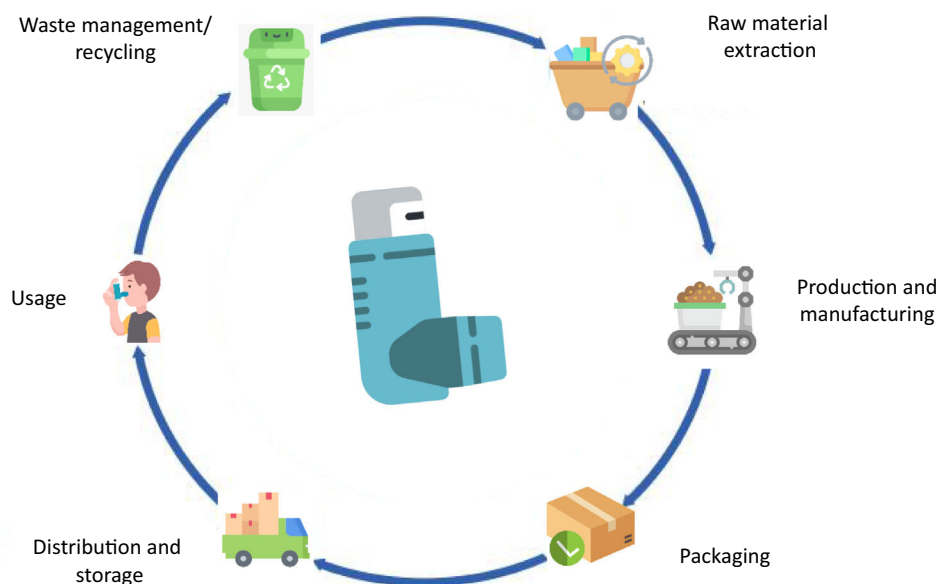
Figure 1. The life cycle of an inhaler.

We included 395 patients ( 253 \pm 21 patients/year) treated with \beta 2-adrenergic agonists, anticholinergics, and/or inhaled corticosteroids (31